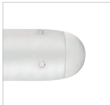
Blunt obturator for the "Hasson technique"