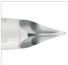
TrocaSys PROTECT – atraumatic dilating trocar